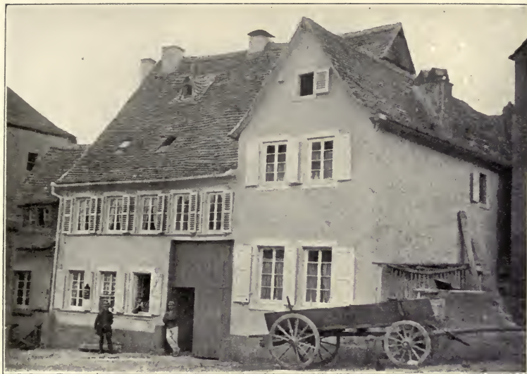
BIRTHPLACE OF OSCAR S. STRAUS OTTERBERG, RHENISH BAVARIA